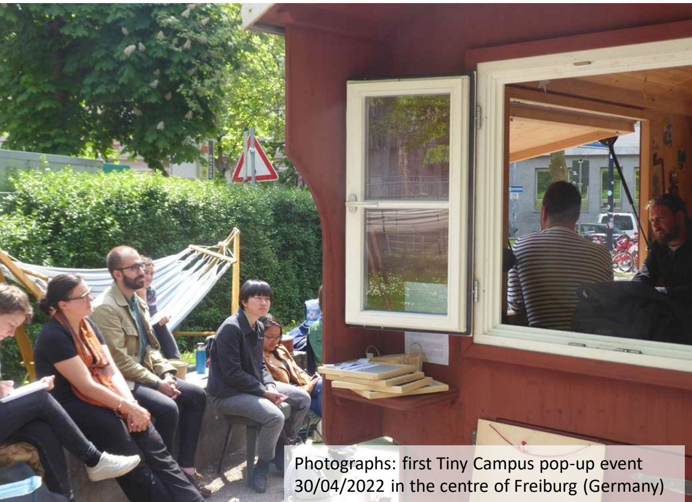
Photographs: first Tiny Campus pop-up event 30/04/2022 in the centre of Freiburg (Germany)