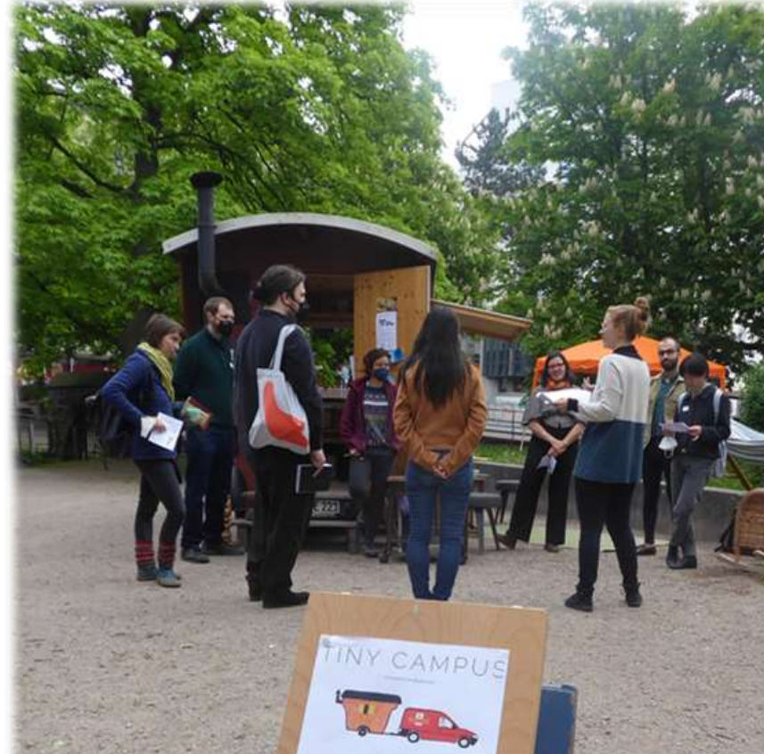
De-walling: “to construct spaces without walls, deprived atmospheres that have entry requirements which are transparent and as low as possible, offer freedom of movement, and sanctuary for all manner of vulnerabilities” (Vrasti and Dayal, 2016, p. 1003)