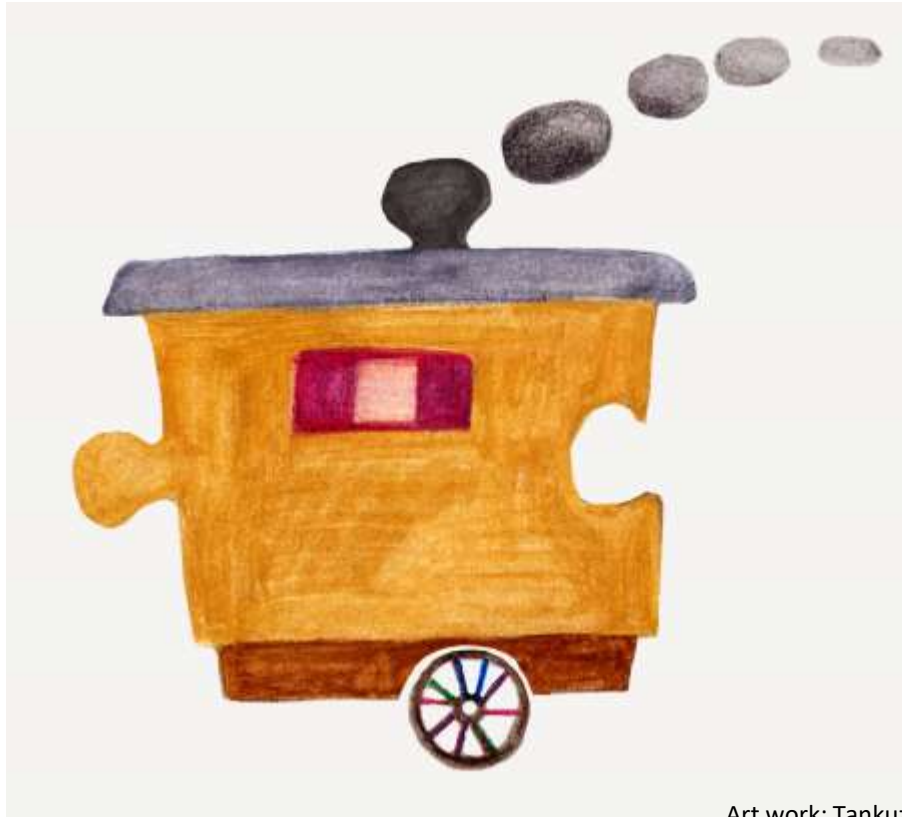
Art work: Tankuz

An itinerant encounter space imagined inside, then developed outside the academy, now situated in between